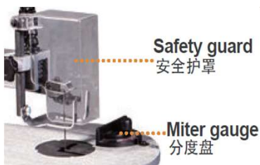
With safety guard And Miter gauge