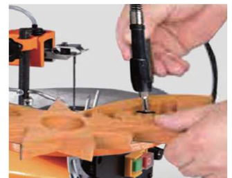
Optional PTO Shaft