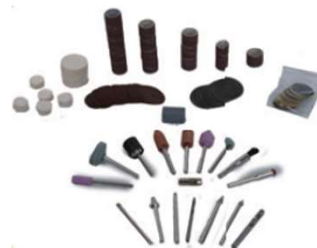
Optional Tool Box