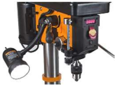
Industrial goose neck lamp