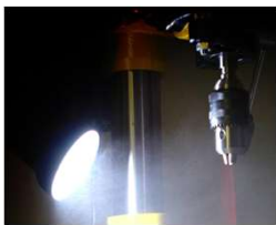
Industrial goose neck lamp