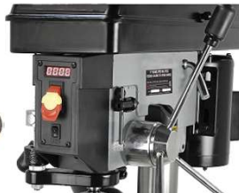
Onboard Chuck key Storage