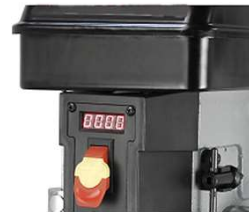
Digital Speed Read Out