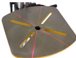
Cross laser guided