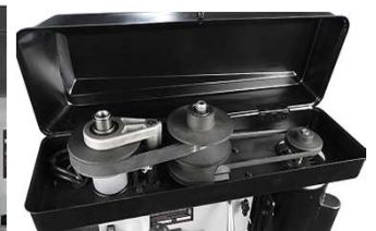
Variable speed pulley system