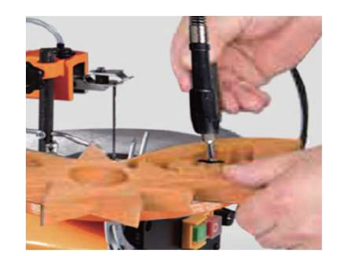
Optional PTO Shaft