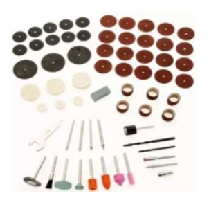
Optional Tool Box